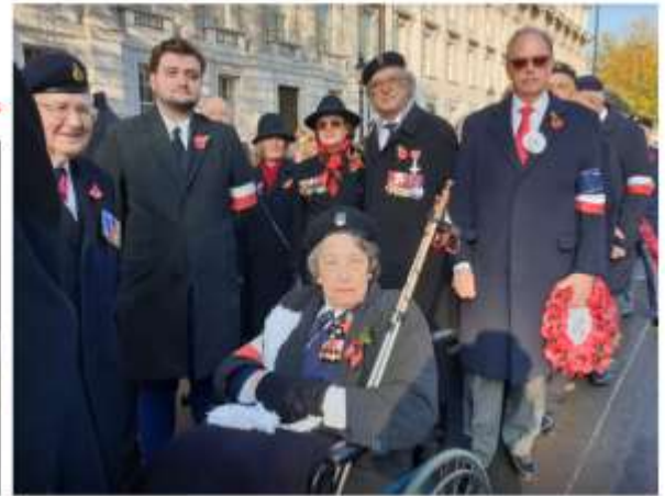
On Sunday 10 November 2019, the National Service of Remembrance was held at the Cenotaph on Whitehall, London as supported by PHS UK and our Veterans. Below, National Memorial Arboretum 2009 in Alrewas.