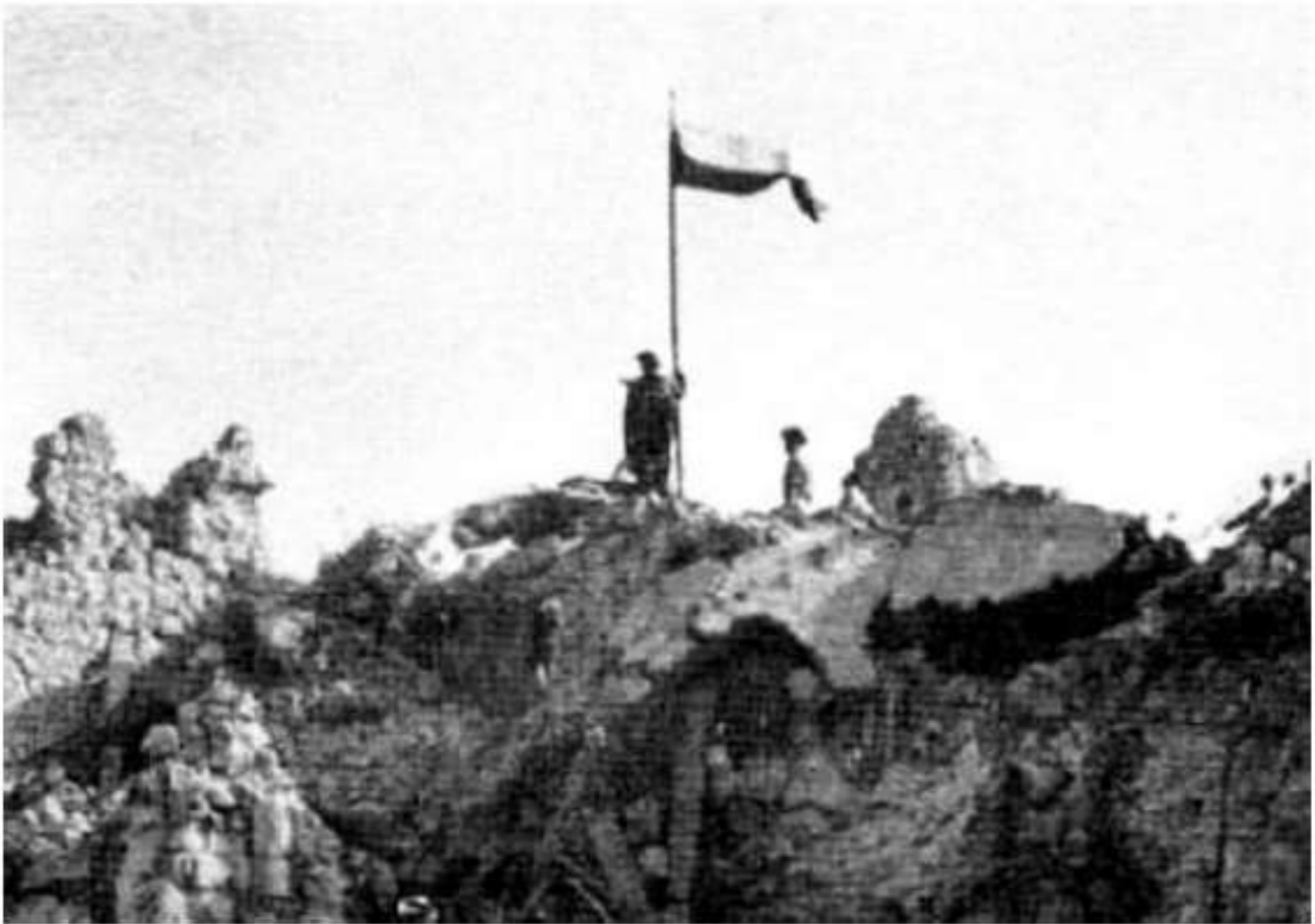
19 May 2015 - Winning key German defensive positions at Monte Cassino and breaking the Hitler Line opened the way to Rome, which was taken over by the U.S. 5th Army on 4 June. The 2 nd Polish Corps paid a very high price for its victory: 923 dead, 2,931 injured and 345 missing in action of whom 251 were found.