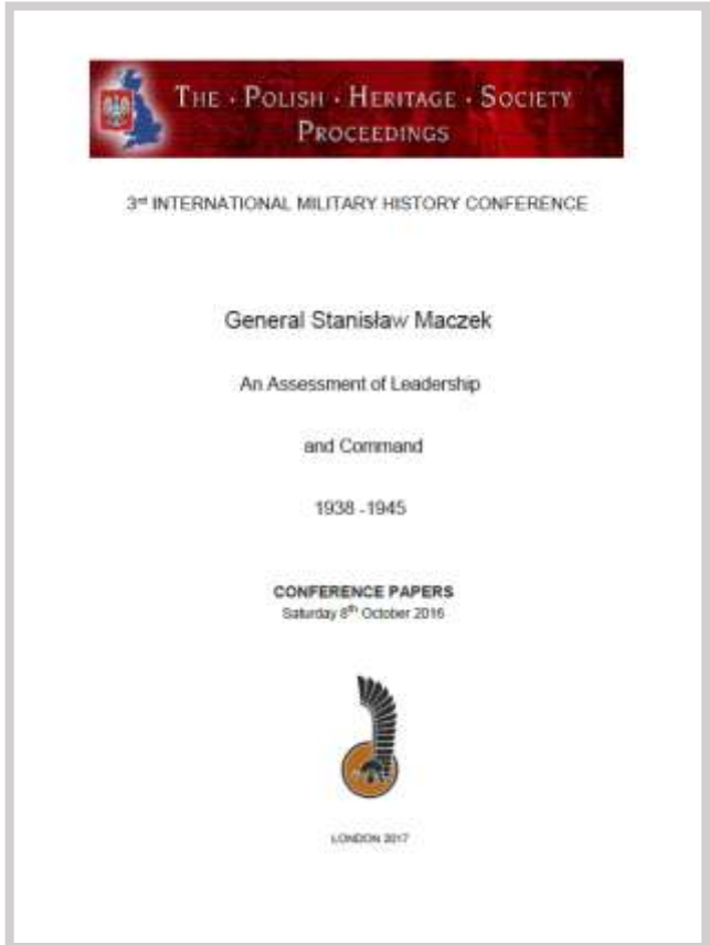
The selected examples of the Conference Proceedings of Military History Conferences during the 2014-2019 years as organised by the Polish Heritage Society UK in London. The combined attendance numbers of the delegates are in excess of 800.