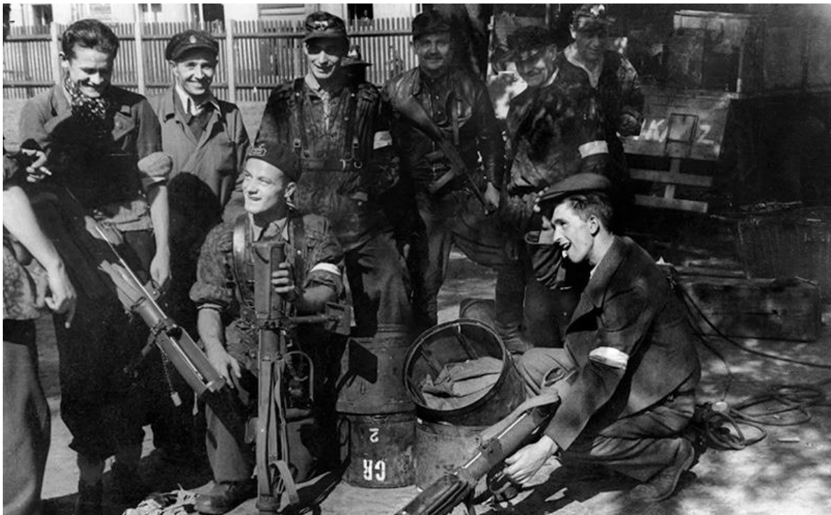
Top left: Commander Jan Piwnik “Ponury” – an iconic Polish Underground picture. Jan Piwnik was a Polish World War II soldier, a S.O.E./Cichociemny and a notable leader of the Home Army in the Świętokrzyskie Mountains. He used the code names: “Ponury” and “Donat”. Top right and bottom pictures show the “ in between ” combat time, showing Polish Underground scenes from the few and rather rare happier moments.