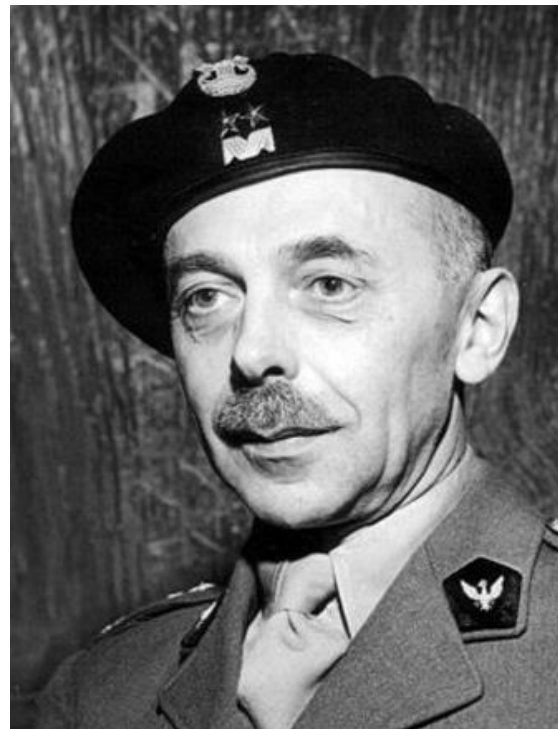
Four key figures shaping AK (Home Army) strategy 1939-1943: Top left: General Władysław Sikorski, Top right: Colonel Stefan Rowecki, Bottom left: General Kazimierz Sosnkowski, Bottom right: Tadeusz Bór Komorowski. Interaction of the Polish Government in Exile and the AK leadership led to an on-going development of strategy grounded in a common approach between 1939 and 1943.