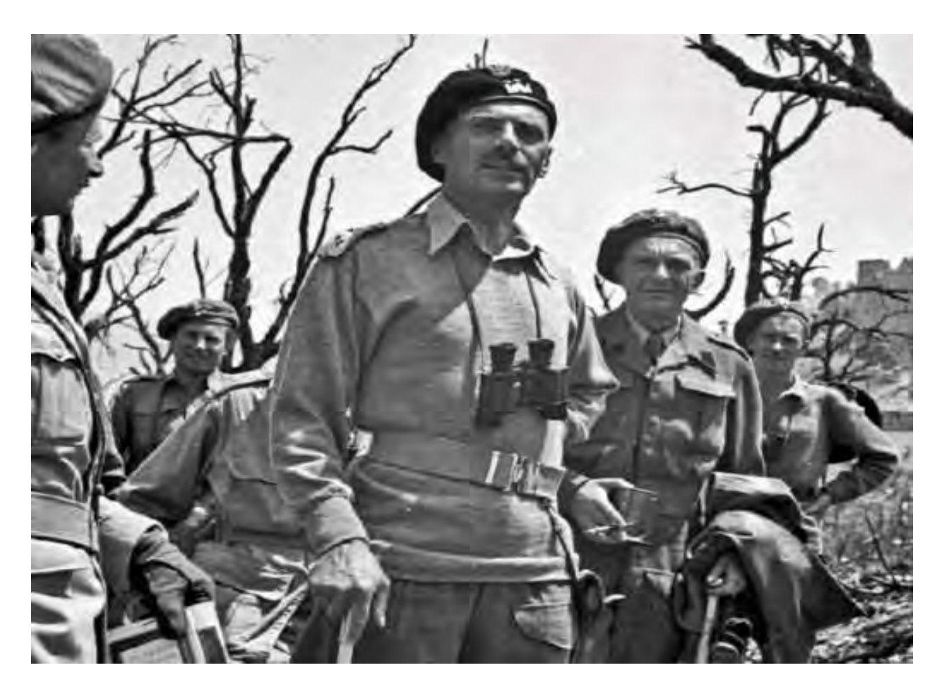
The Polish II Corps, 1943–1947, was a major operational unit of the Polish Armed Forces in the West during World War II. It was commanded by General Władysław Anders who fought with distinction in the Italian Campaign, in particular at the Battle of Monte Cassino. During three subsequent battles it suffered heavy losses in the final stage of the Battle of Monte Cassino.