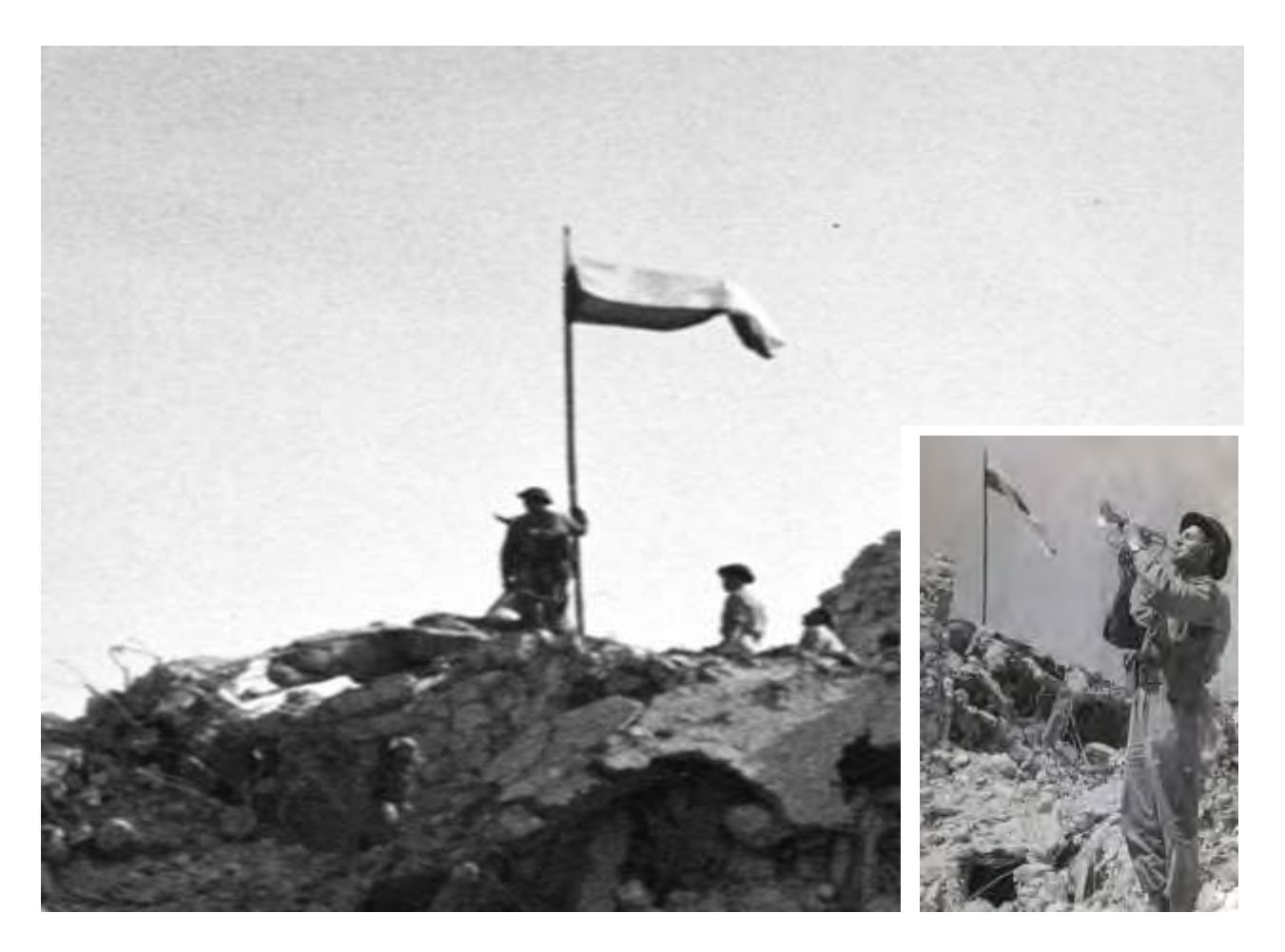
17-18 May 1944, The Second Polish Corps took key German defensive positions at Monte Cassino, breaking the Hitler's Gustav Line and opened the way to Rome. It was replaced in the line by the U.S. 5th Army on 4 June. The 2<sup>nd</sup> Polish Corps paid a very heavy price for its victory: 923 dead, 2,931 injured and 345 missing in action of whom 251 were eventually retrieved.