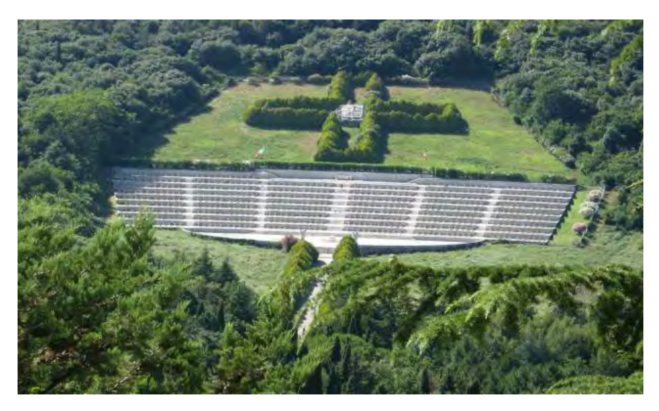
The Polish war cemetery at Monte Cassino holds the graves of 1,072 Poles who died storming the bombed-out Benedictine abbey in May 1944, during the Battle of Monte Cassino.