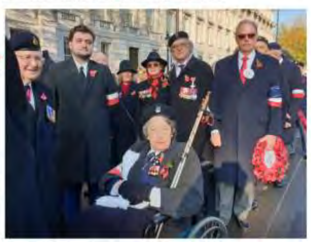
On Sunday 10 November 2019, the National Service of Remembrance was held at the Cenotaph on Whitehall, London attended by PHS (UK) and Polish Veterans. Below, The National Memorial Arboretum 2009, Alrewas.