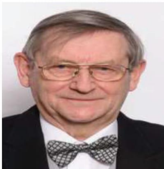
Professor Norman Davies