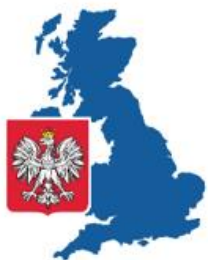
Polish Heritage Society (I)