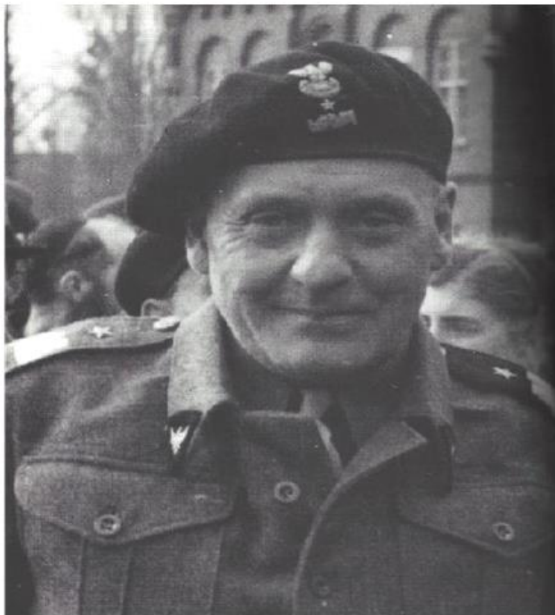
General Stanisław Maczek DSO 1938-1945