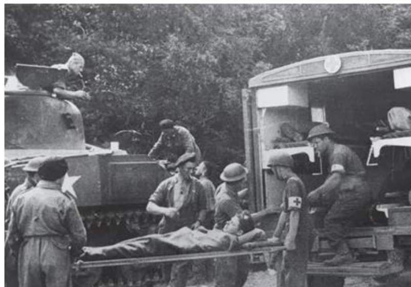
Polish casualties are evacuated from the battlefield.