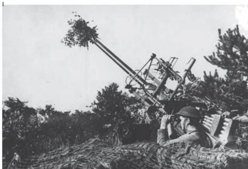
Polish anti-aircraft battery on watch for German fighter-bombers.