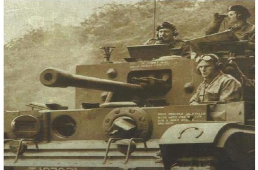
6th May 1946, over 34,000 German prisoners were captured, disarmed and reclassified as POWs.