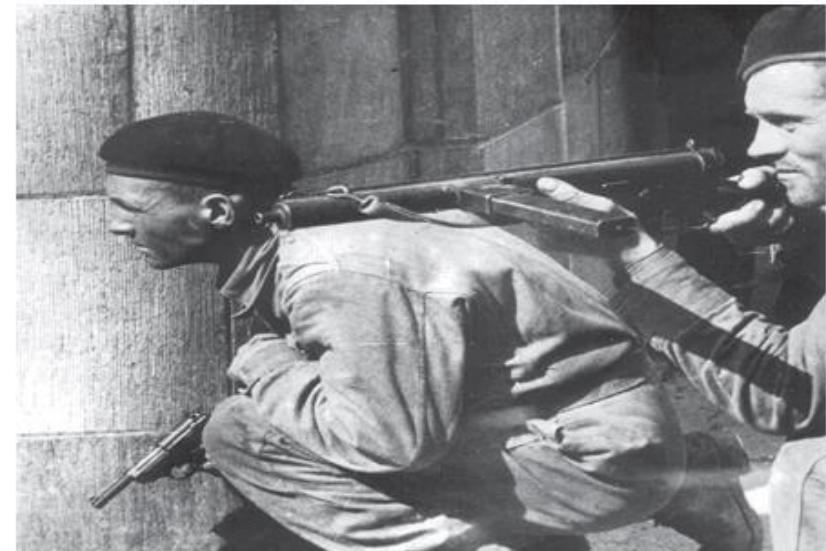
Polish forces are in the thick of the fighting to liberate Europe.