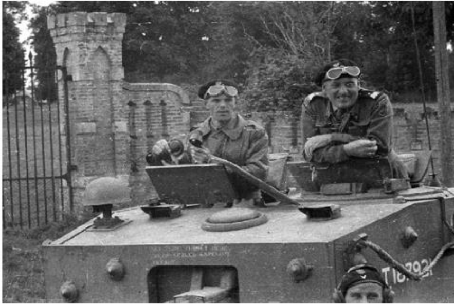
General Maczek, The 1 st Polish Armoured Division in Abbayeville, Normandy, 1944.