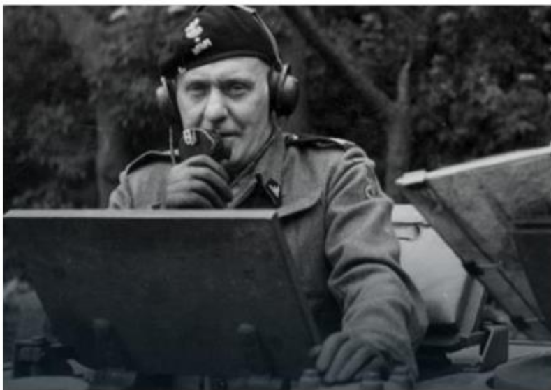
General Maczek commanding 1st Polish Armoured Division in Holland.