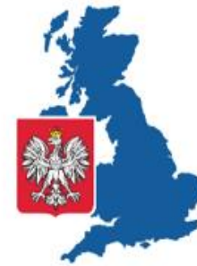
Polish Heritage Society (UK)