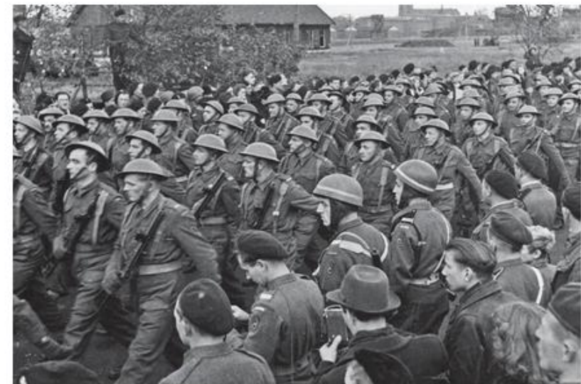
1944, Polish forces receiving the freedom of the city of Breda in Holland.