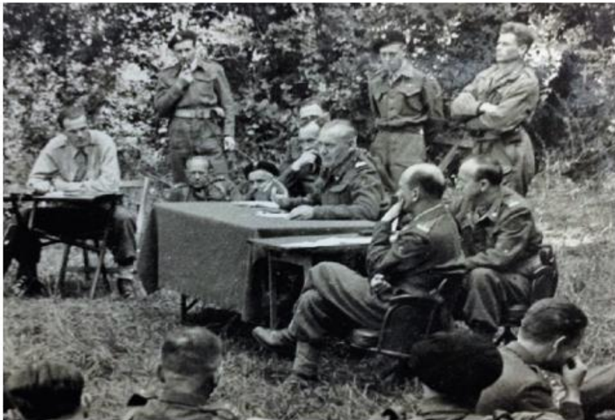
General Maczek with some of his officers at Abbayeville, Normandy, 1944.