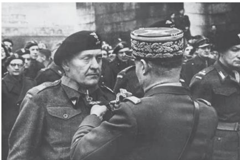
General Alphonse Juin decorating General Maczek of the Polish 1st Division in France.