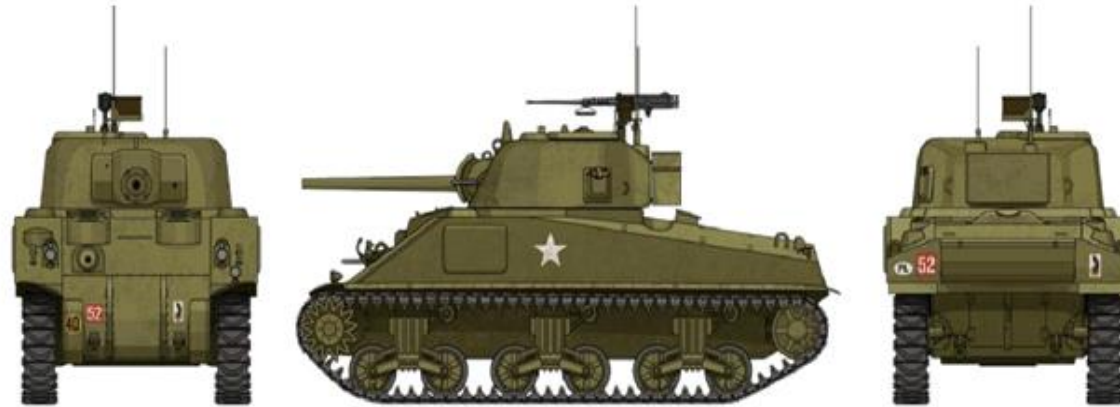
Above: Sherman V (M4A4), 2 nd Armoured regiment. Below: Cruiser VIII (A27) Cromwell VII on the left, 10 th Mounted Rifle Regiment and 17. pounder. Self Propelled, 1 st Anti Achilles Tank Artillery Regiment, "Bydgoszcz" on the right. Both Achilles and 2 Cromwells were used by Poles in Normandy in 1944.